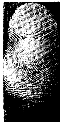
INNOVA "Cobalt Blue"® LED flashlight $40