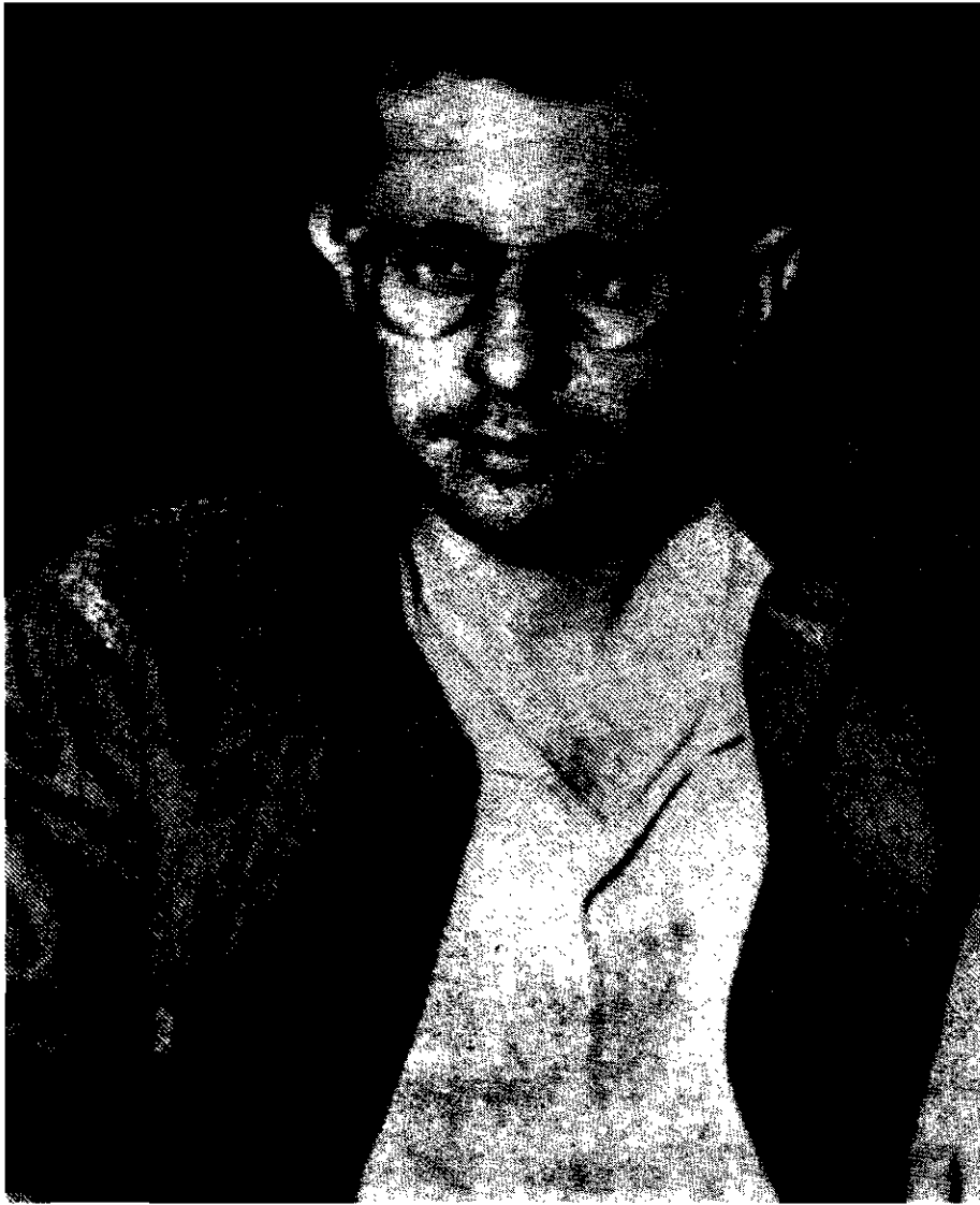
Figure 3: Serial Killer Harvey Glatman after his arrest.