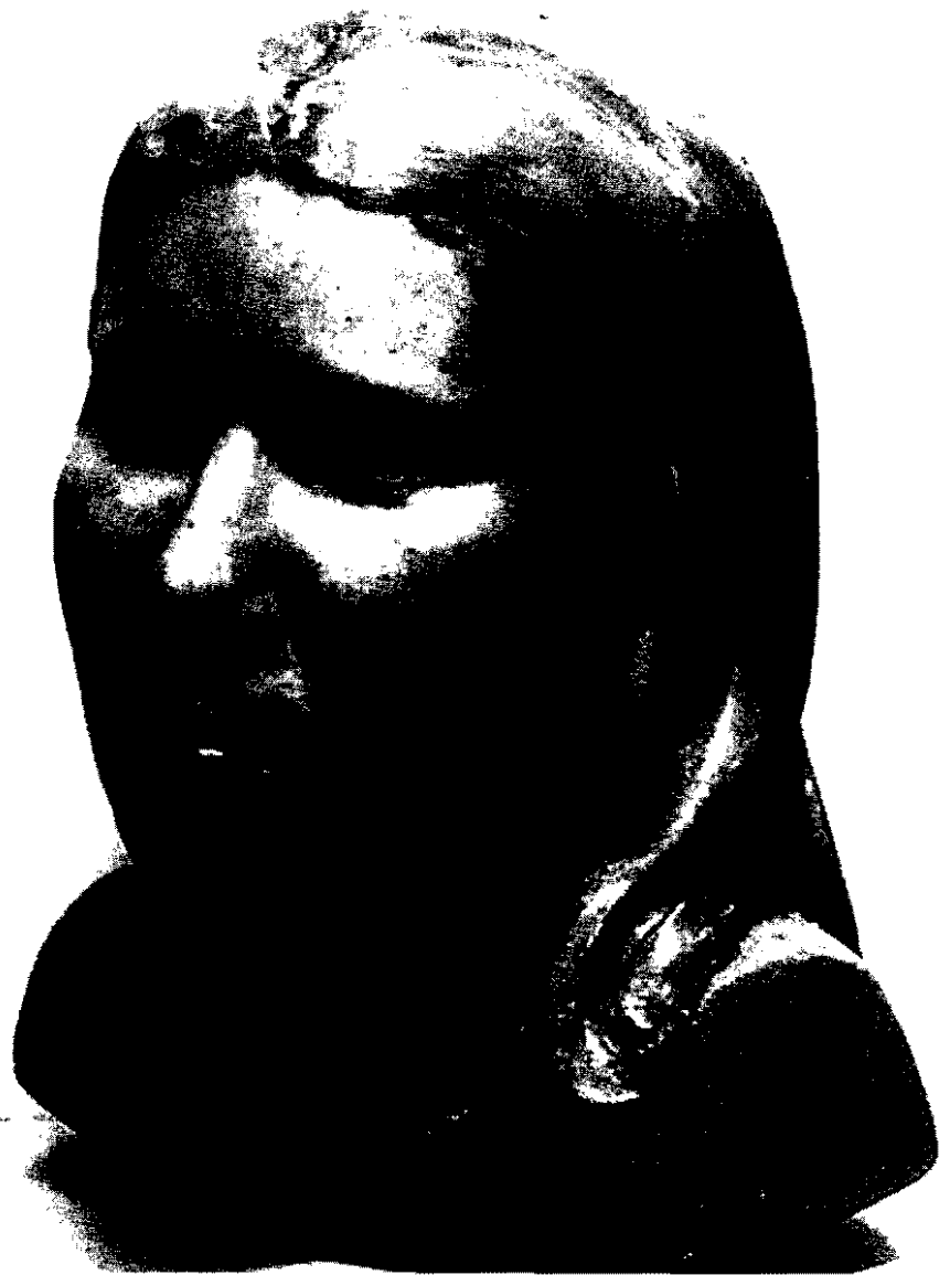
Figure 1: Bust of "Boulder Jan Doe"

As investigators learn early, months and years of effort and the resultant hope and expectations can be dashed in an instant. An